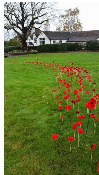
Bringing London to Barlaston on Remembrance Sunday, the ladies of Barlaston WI