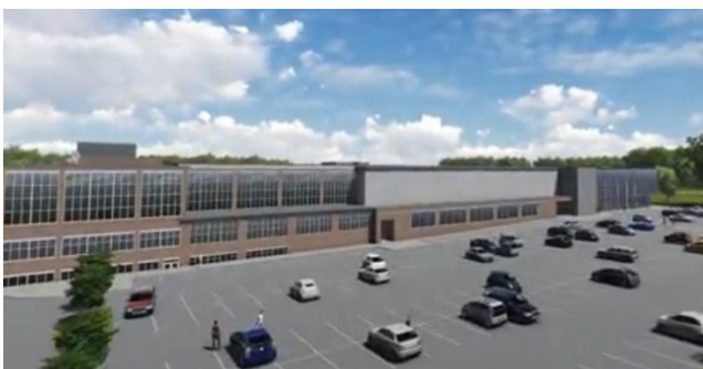
The image above depicts how our office block will look upon completion.

Sustainable growth is something that modern companies are addressing more and more - in this day and age, everybody should be doing all they can to protect the environment, enhance employee's health and minimise costs. This encompasses a number of initiatives including reducing our carbon footprint and minimising waste using the principles of Reduce, Reuse, Reclaim and Recycle (4R's), implementing environmental management systems and even introducing 'green travel' schemes for our employees that commute to Barlaston.