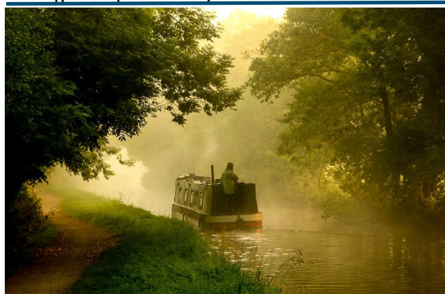
On the 9th July BBC Midlands Today shared Barlaston photographer Jon Kelso's beautiful photo of the early morning Barlaston canal on Twitter. Weather presenter Shefali Oza selected it as the weather photo of the day. We thought we'd share it too!

and unique record of over 250 years of British ceramic production. They may also choose to create their very own piece of Wedgwood in the Master Craft, Decorating and Design Studios before enjoying a wide range of food and beverages from our various dining amenities. Visitors looking to take a piece of Wedgwood home will be spoilt for choice as our concept store is the largest display of Wedgwood product anywhere in the world.