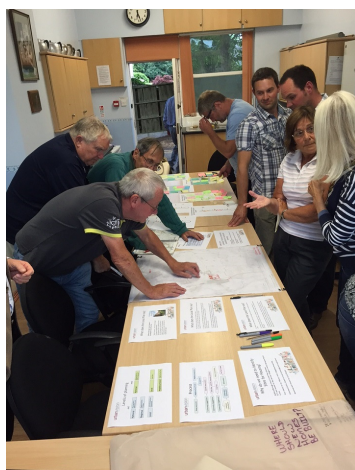
Urban Vision led recent consultation sessions with villagers in each parish ward.

To ensure Barlaston has sustainable development and supports its residents with employment, enjoyment and an environment that all can enjoy.